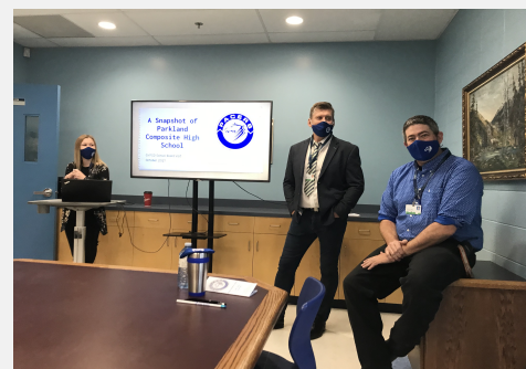
Ensure all School Leaders focus on Data Analysis to Inform the School's Instructional Foci