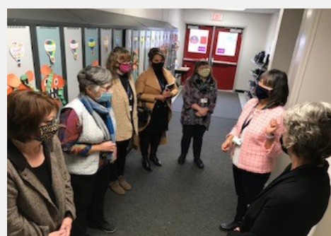
Ensure school and Division budgets are balanced and align with the Board's 3 priorities.

Attended the College of School Superintendents' (CASS) 3 Day Fall Conference