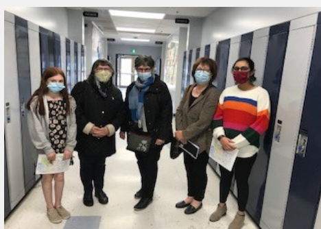
Ensure every school has Mental Health and Wellness Supports for Students