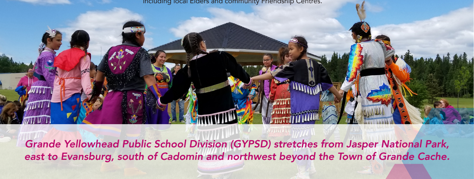
Grande Yellowhead Public School Division (GYPSD) stretches from Jasper National Park, east to Evansburg, south of Cadomin and northwest beyond the Town of Grande Cache.

with culturally responsible resources helps to create a welcoming, respectful, safe and caring learning environment for all students to be successful. GYPSD proudly partners with many individuals and organizations to support our youth and develop our Indigenous programs including local Elders and community Friendship Centres.