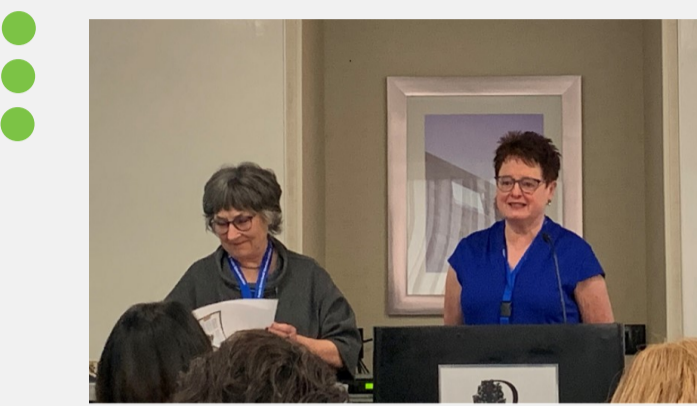
Presentation with the Board Chair at PSBC's Professional Learning Event: Board Policy and Administrative Procedures

Here are a few highlights since the January 26th PBM!