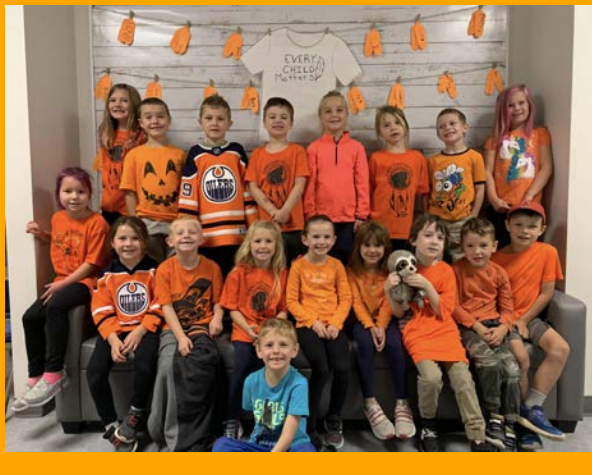
Hinton: Crescent Valley and École Mountain View Elementary and Harry Collinge High Schools came together and were joined by hundreds from the Hinton Community to recognize the National Day for Truth and Reconciliation and Orange Shirt Day