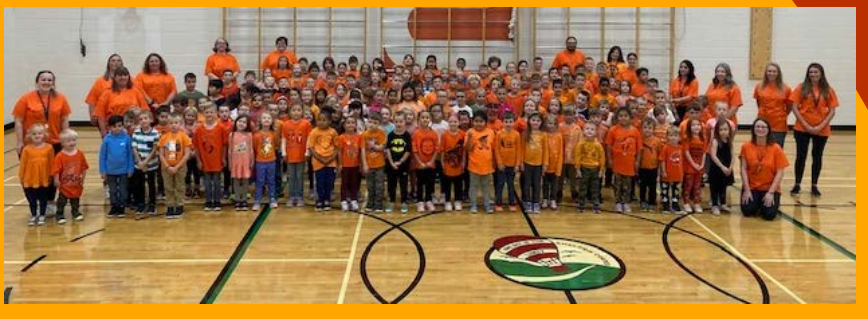
Grande Cache Schools: Sheldon View Elementary Summitview Middle School Grande Cache Community High School