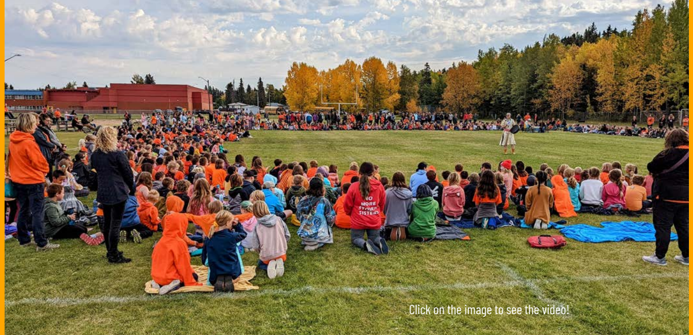
Click on the image to see the video!