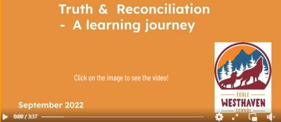
Edson Schools: Fulham, École Westhaven, Mary Bergeron Elementary, École Pine Grove Middle, Parkland Composite High School