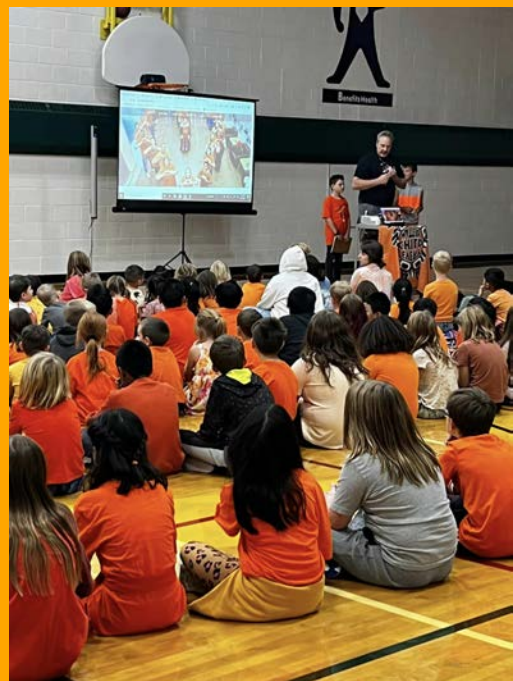
École Jasper Elementary and Jasper Junior/Senior High School