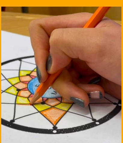
Lobstick Zone: Niton, Wildwood, Evansview and Grand Trunk High School