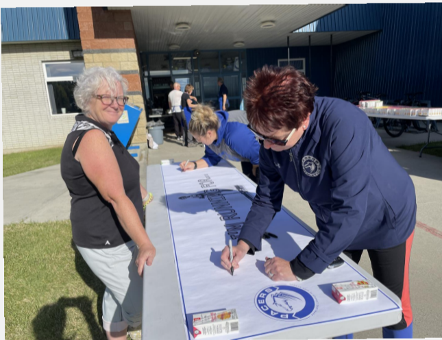
Terry Fox Run