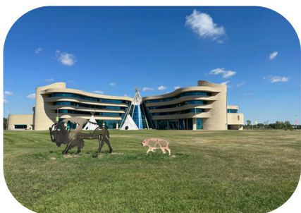
First Nations University of Canada, Regina, Saskatchewan.