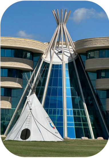
First Nations University of Canada, Regina, Saskatchewan.