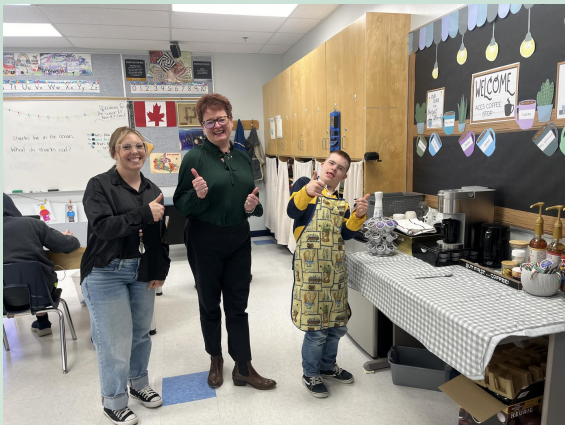
Visiting the ACEs classroom and new Coffee Bar Learning Centre at PCHS