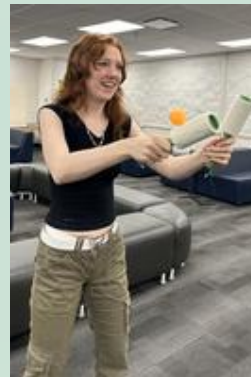
SYC at HCHS