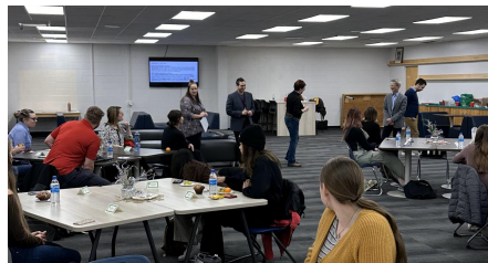
Researching & Surveying